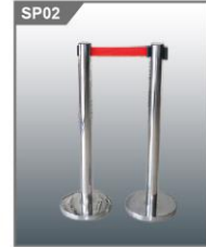
SP02 围栏 Barricade For Queue 1200H mm