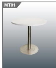
MT01 白色圆桌 Round Table 800Φ x 750H mm