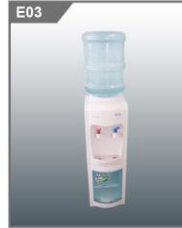
E03 饮水机 Water Dispenser