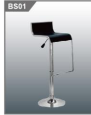
BS01 吧椅 Bar Stool 460W x 400D x 455H mm