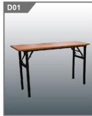
D01 长条桌(无桌布) Long table w/o apron 1200L x 450W x 750H mm