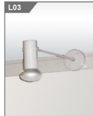
L03 9W LED长臂射灯 9W LED Long Arm spotlight