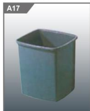
A17 废物箱 Wastepaper Basket 250L x 170W x 290H mm