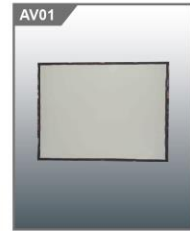
AV01 投影设备 Projector&Screen