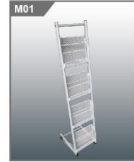
M01 杂志架A Magazine Rack A 380 x 1500H mm