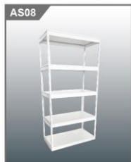
AS08 货架 Cargo Rack 1000L x 500W x 2000H mm