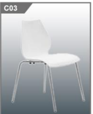
C03 葫芦椅 Glisso 480W x 550mm x 800H mm