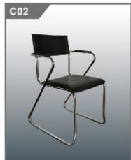
C02 皮椅 Black Leather Arm Chair 570W x 440D x 455H mm