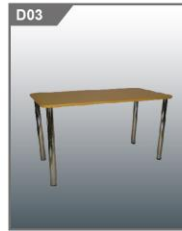
D03 会议桌 Meeting Table 1400L x 700W x 750H mm