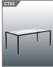
CT02 双人咖啡台 Coffee Table 1000L x 550W x 450H mm