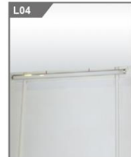
L04 21W LED日光灯 21W LED Fluorescent Tube