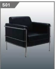
S01 单人沙发 Single Sofa 700W x 700D x 455H mm