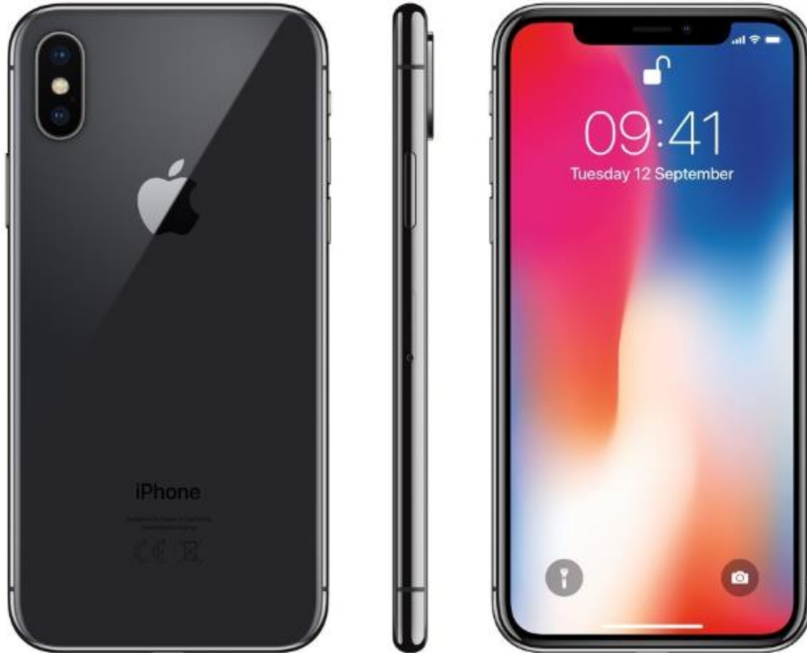
i Phone X